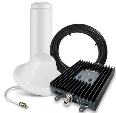
SureCall FlexPro Omni/Dome kit